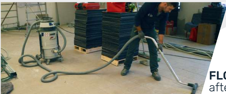
FLOOR CLEANING after work