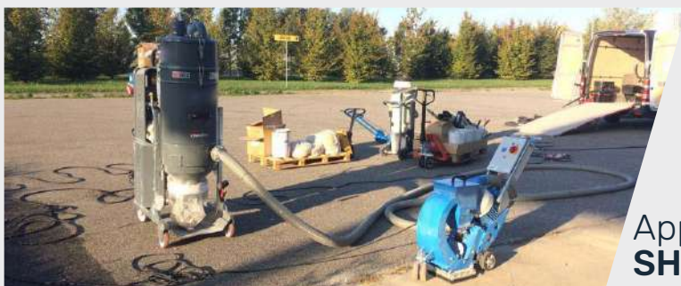
Application with SHOT BLASTER