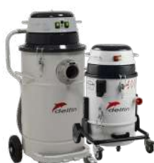
Application with CORE DRILLING MACHINE