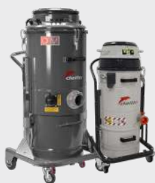
Application with FLOOR SCARIFIER