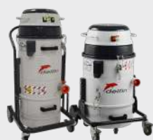
Application with MANUAL TOOL