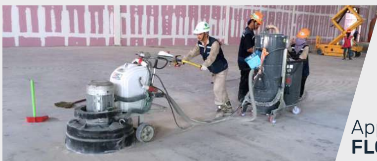
Application with FLOOR GRINDER