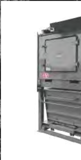
ENGINEERED AND CUSTOMIZED SOLUTIONS