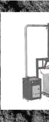
CENTRAL VACUUM SYSTEMS