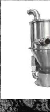
PNEUMATIC CONVEYING SYSTEMS