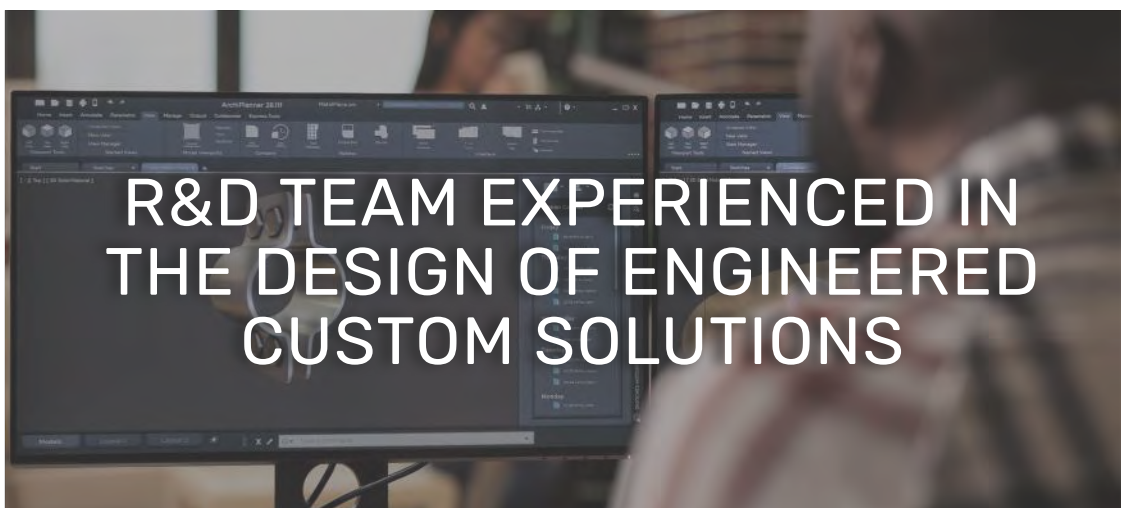
R&D TEAM EXPERIENCED IN THE DESIGN OF ENGINEERED CUSTOM SOLUTIONS