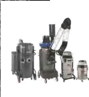
PORTABLE VACUUMS FOR INDUSTRIAL CLEANING

We are a global leader in the manufacturing of industrial vacuum machines, ranging from portable vacuums for industrial cleaning, to central vacuum systems and engineered solutions to pneumatic conveying systems.